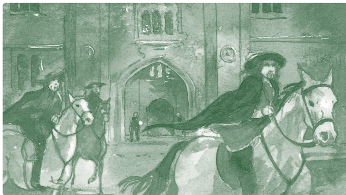
‘The King has escaped from Hampton Court.’